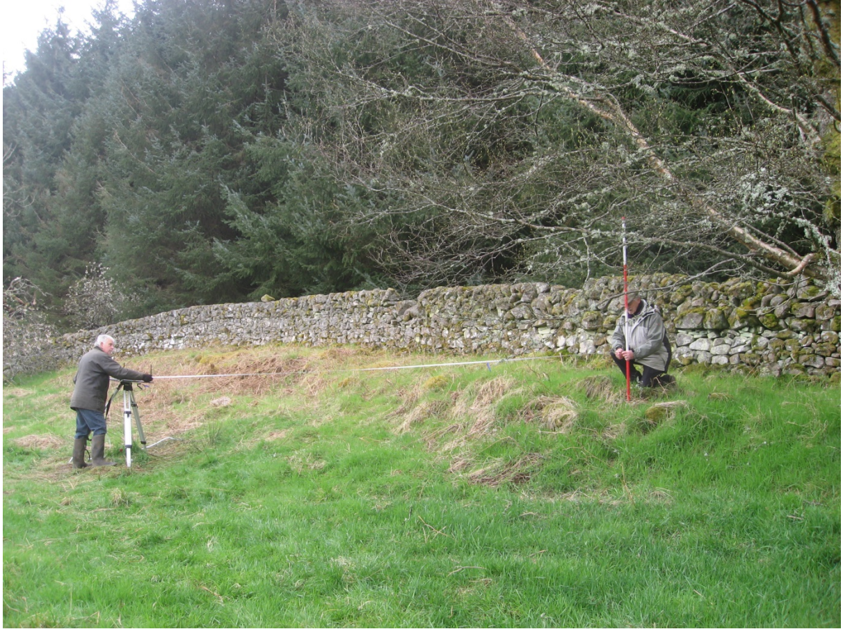
Fig 2 Plane Table survey in progress